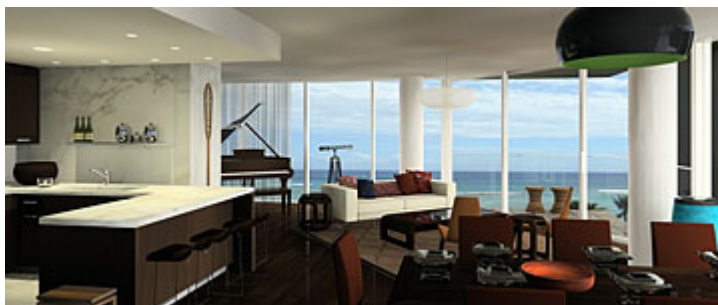
IRONGATE CAPITAL PARTNERS Artist's rendering of Trump's project kitchen/living room space.

While official price points have not been released, some in the real estate business have said that they have been quoted unit costs ranging from the high $600,000s to about $7 million. Suites in the hotel rental pool are expected to fetch average daily room rates well above $400 a night, Fisher said.