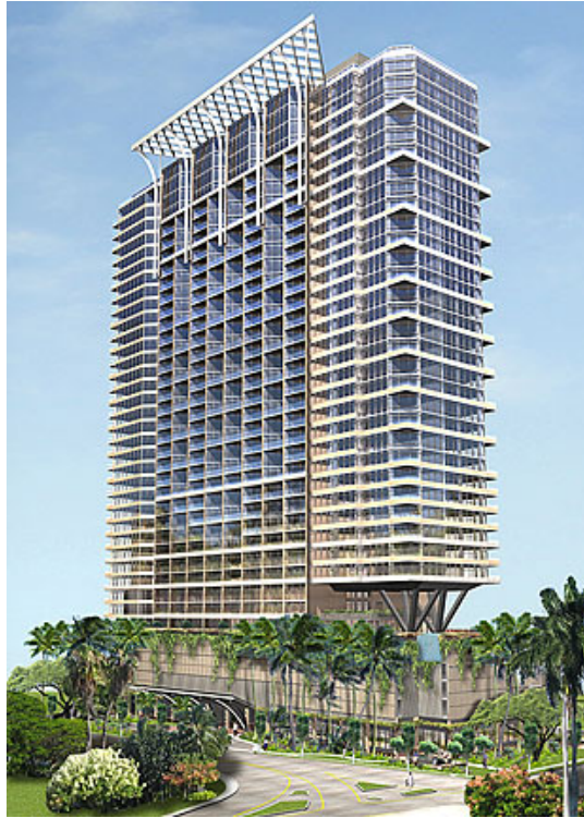
IRONGATE CAPITAL PARTNERS Artist's rendering of Donald Trump's Waikiki project. CLICK FOR LARGE